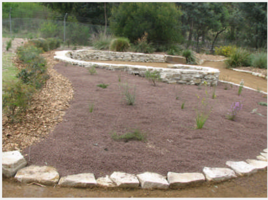
Our new wall and garden

Men and women and their carers, from Life Without Barriers use the site daily; engaging with the community; working in the nursery and garden and thus providing valuable support in the propagation of native plants; and caring for their community vegetable garden.