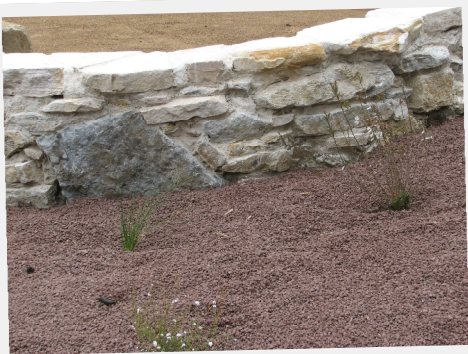
The beautiful stone wall

Men and women and their carers, from Life Without Barriers use the site daily; engaging with the community; working in the nursery and garden and thus providing valuable support in the propagation of native plants; and caring for their community vegetable garden.